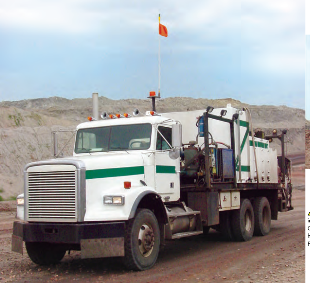
PICTURED: AP WHIP IN USE

▲ WARNING: This product can expose you to chemicals including Nickel Compounds, which is known to the State of California to cause cancer and birth defects or other reproductive harm.