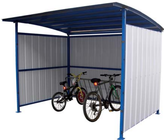
MDS-96-BK Completed Assembly

The Bike Rail simply slides over the Bike Bracket posts and is secured on the left side by the 5/32" X 1-1/2" Cotter Pin.