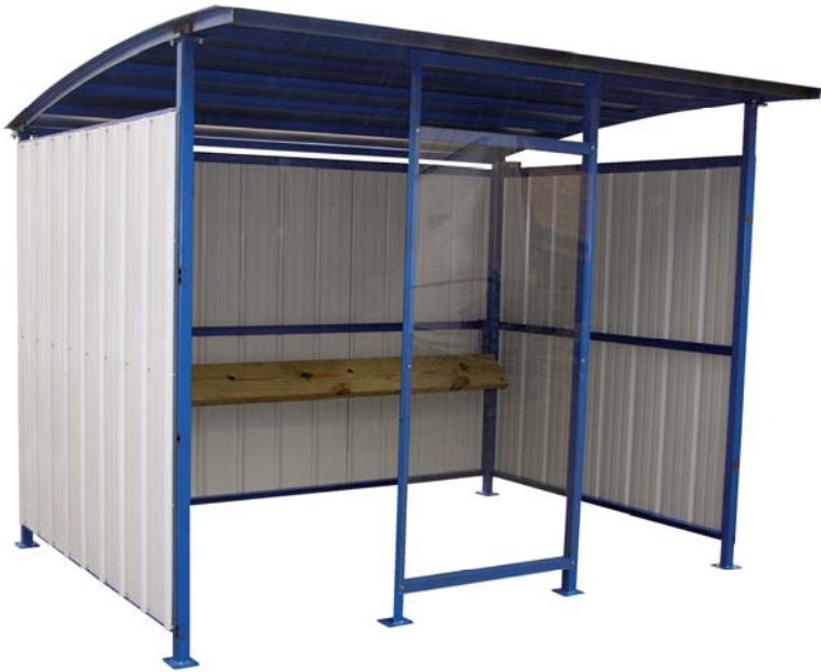
MDS-96-SM Completed Assembly